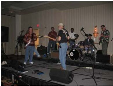
The Porch Dogs do their thing at the annual PCB East Gala.

Of course, no PCB East event is complete without top quality entertainment. The casino night kept everyone out lateand the Porch Dogs did their thing in the next room.