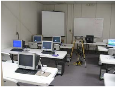
Training for new ERP (manufacturing) system is done on site for all employees that need it