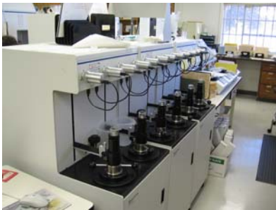
Measuring minute particles is no big deal to these unique pieces of equipment