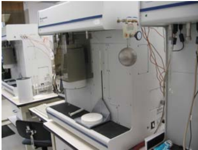
Measuring minute particles is no big deal to these unique pieces of equipment