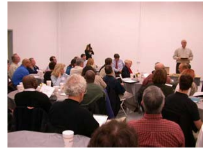
Over 70 attendees enjoyed ribs, technology, and fun at the SMTA meeting at Viscom.

YOUR CHAPTER of the SMTA should be going.