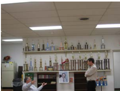
They work hard and play hard as seen by all of the trophies in the break room