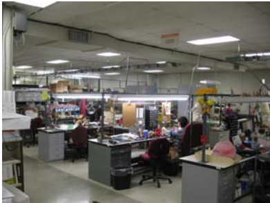
One of the assembly areas where the equipment is manufactured