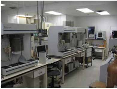
Inside their material analysis laboratory